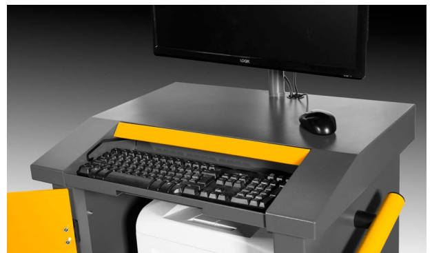
23" display monitor, keyboard, printer and mouse all housed in a high quality, mobile cabinet

E & O E. The Company reserves the right to introduce improvements in design or specification without prior notice. The sale of this product is subject to our standard terms, conditions and relevant product warranty. MY15 April V2