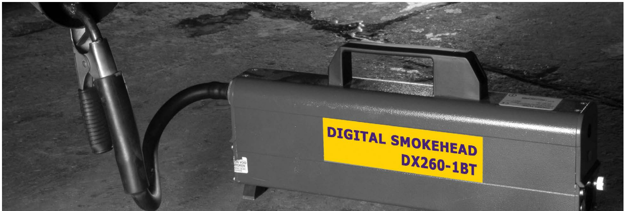
Digital Smoke Head